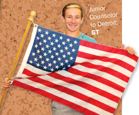
Junior Counselor to Detroit: GT